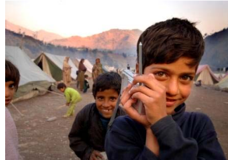
A boy listening to a radio at Thory Park camp in Muzaffarabad. WHO and UNICEF have distributed over 15,000 radios since October 2005 to disseminate health-related messages to the earthquake-affected population.